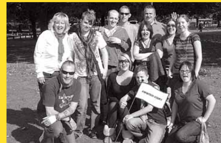
Staff and clients from Ashwood Court enjoy a trip to Coombe Abbey Country Park

Every Friday morning we operate a 'drop in' for prospective clients. Staff hold an informal 'chat' about the service we offer. We can also help you to complete the application form if needed. For more information please contact us on 01788 568420